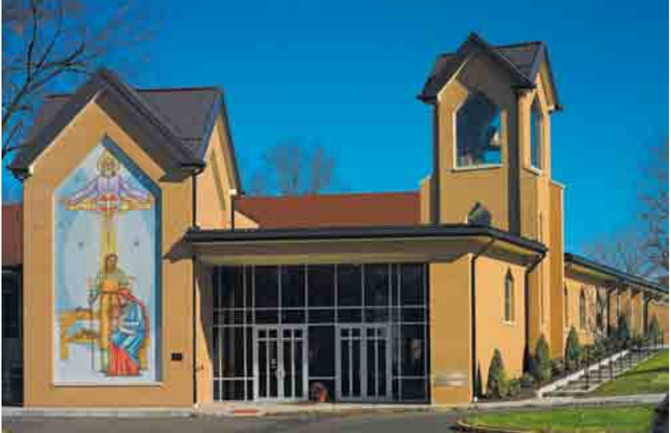
GUIDING SYMBOLS Flanked by a new bell tower and a massive, meticulously detailed mosaic depicting Christianity’s holy family, the west-facing curtainwall of the narthex was designed to become the new main entry into the church.

which parishioners pray 24/7, seven days a week).